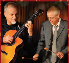
THE BURCHFIELD BROTHERS