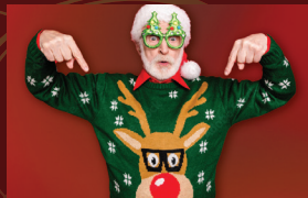
UGLY SWEATER NIGHT