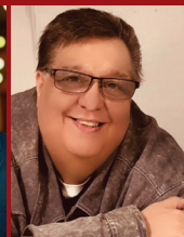
BIG MO & FAMILY