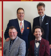
PORT CITY QUARTET