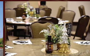
TRADITIONAL CHRISTMAS FEAST