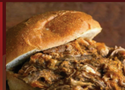
TONY'S BBQ NIGHT